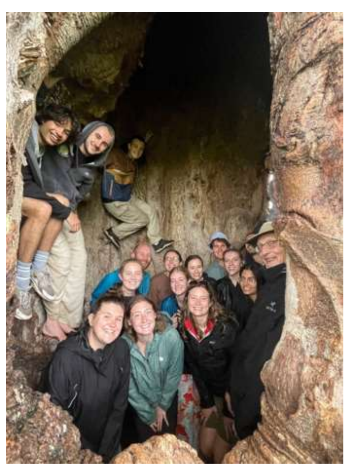
2024 class in a baobob

Fourteen University of Minnesota students visited Iringa, Tanzania, including Masisiwe, as part of their Design for Life class for three weeks this past December and January. They will be presenting summaries of their visits on Tuesday, February 27 at the University of Minnesota campus. A social hour including a meal will begin at 5 pm at Lind Hall with presentations from 6:15-8 pm in Tate Hall (116 Church Street SE Minneapolis). Congregation members are invited to participate in the presentations to learn about the students' experiences in Masisiwe and Tanzania. Register online by Wednesday, February 21.