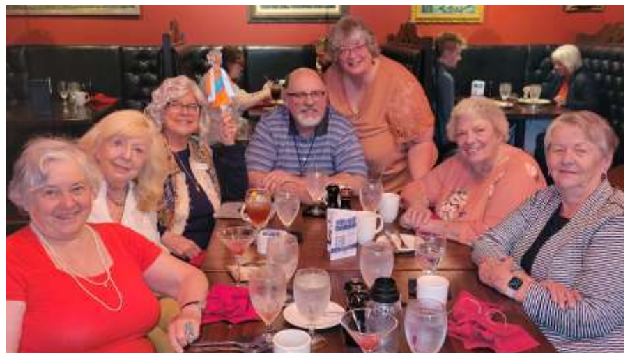
With the Lunch Bunch.