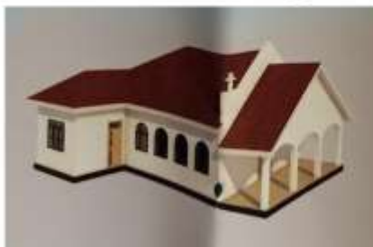
Diagram of Tumaini Church, 5 th Masisiwe Preaching Point

We have attached some drawings of our new church construction at Tumaini preaching point.