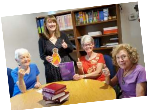
At Women's Bible Study.