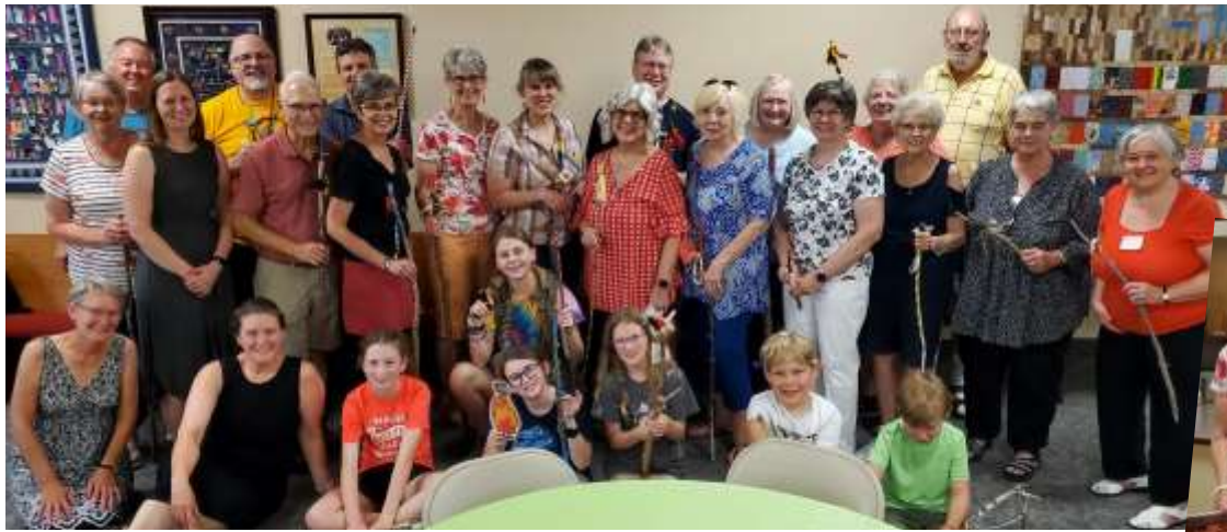
At Journey Together.