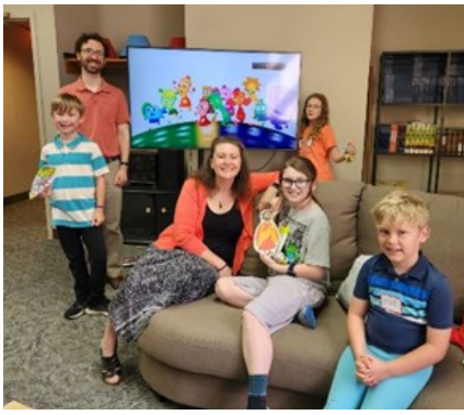
Celebrating the end-of-the-year Sunday School Party