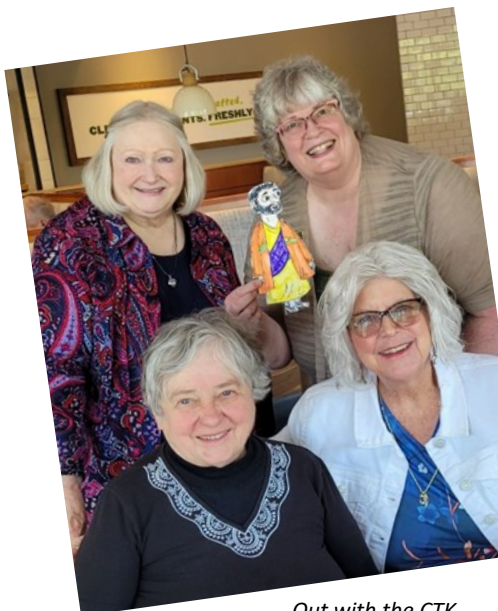
Out with the CTK Sunday Brunch Bunch