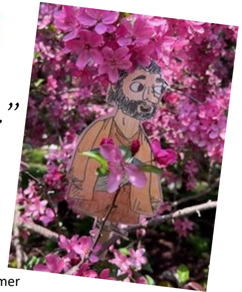
Out for a walk in Mahtomedi.