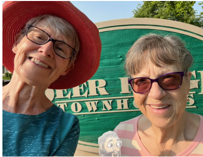
Walking with neighbors.