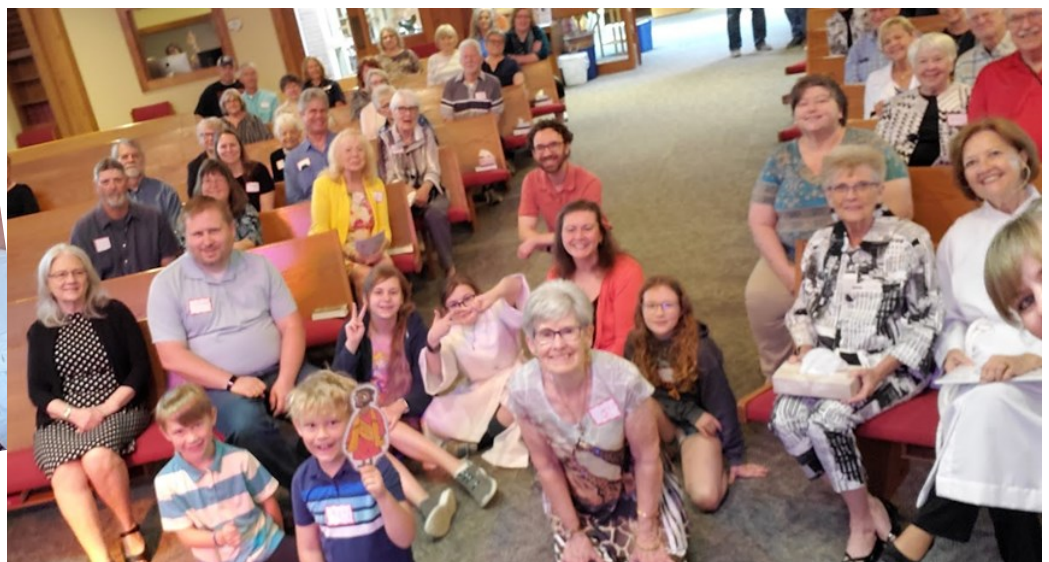
Launching into the world on Sunday, May 21.